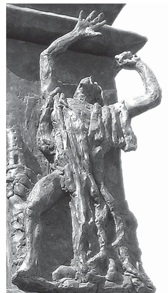
Jeremiah laments at the destruction of Jerusalem : Detail from the Knesset Menorah, Jerusalem.

CSF Award for Best Doctoral Student's Presentation